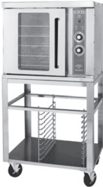
Model WKEHD1 shown with optional stand